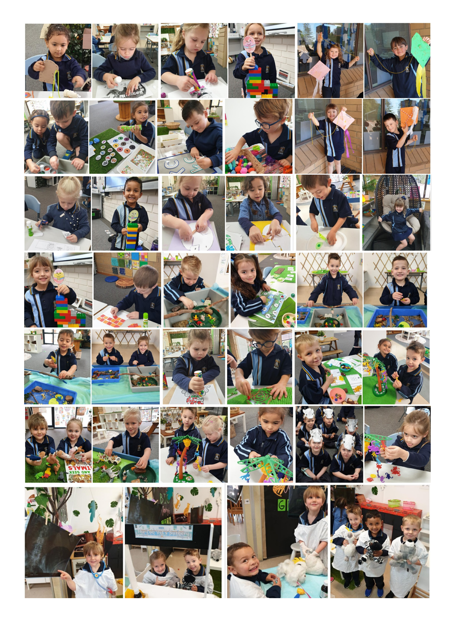
St Michaels performance